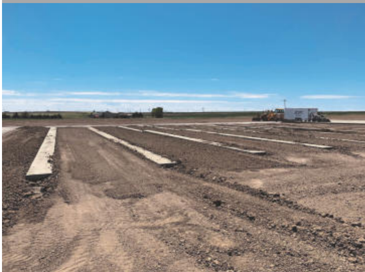
Pre-set monument pads in the initial burial plot area, as seen from the north.

The concrete work at the new cemetery is progressing well! The central core of the cemetery will have paved roads that lead to the planned covered pavilion, which will be used for final commendation services. The paved roads will also encircle the pavilion area and the initial area for burial plots. A parking lot that will accommodate forty vehicles is also under construction. The burial plots will have pre-set monument pads, which will provide for simpler monument installation and provide for ease of maintenance.