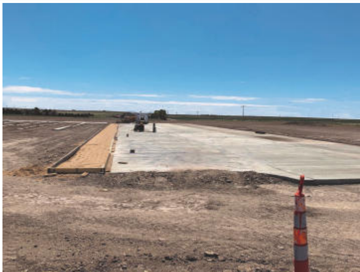
The parking lot area, as seen from the north.