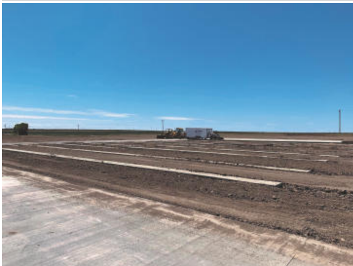
The pre-set monument pads, as seen from the north/south road on the east side of the initial burial area.