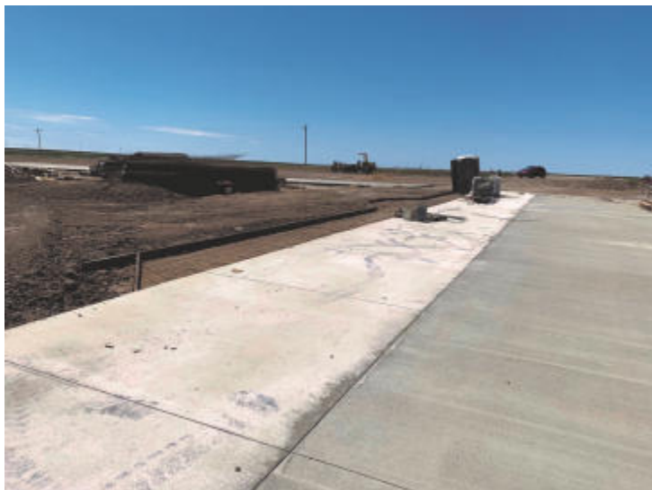
A portion of the east/west main entrance road which will run adjacent to the planned pavilion.